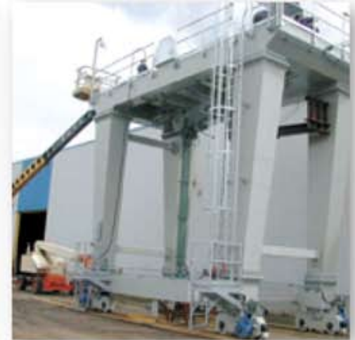
Mechanical Equipment Manufacturing