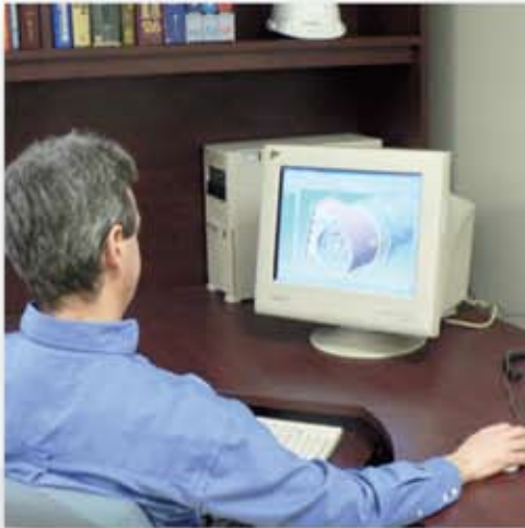
Engineering and Design