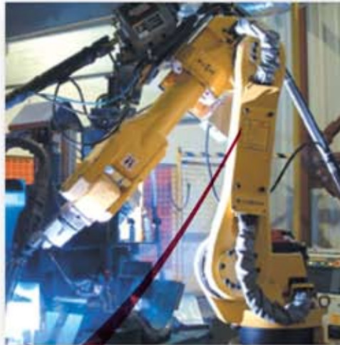
Automated Manufacturing Process